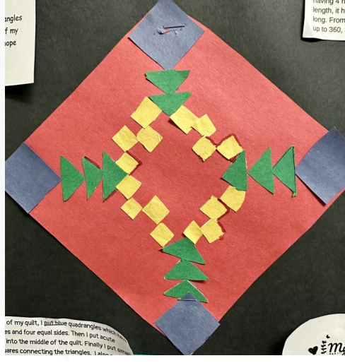
Grade 6M Quilts blocks emphasizing shapes, angles and symmetry