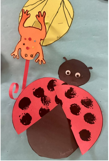
Grade 1 Ladybugs and frogs