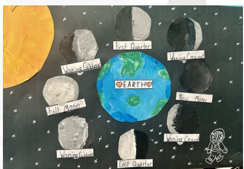
Grade 4C Moon Phases